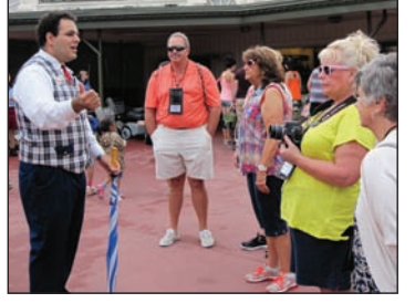
Disney's Keys to the Kingdom Tour was a sell-out!